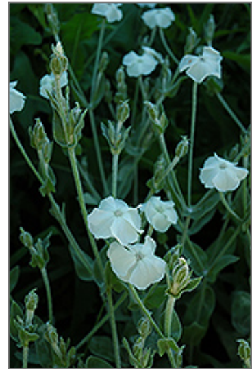
White Rose Campion flowers