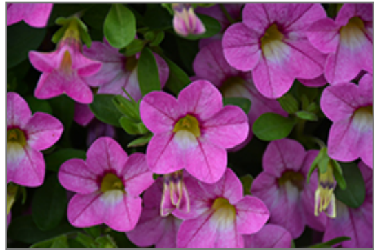
Chameleon Pink Diamond Calibrachoa flowers

Chameleon Pink Diamond Calibrachoa is a dense herbaceous annual with a trailing habit of growth, eventually spilling over the edges of hanging baskets and containers. Its medium texture blends into the garden, but can always be balanced by a couple of finer or coarser plants for an effective composition.