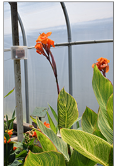
Bengal Tiger Canna flowers

This plant should only be grown in full sunlight. It requires an evenly moist well-drained soil for optimal growth, but will die in standing water. It is not particular as to soil pH, but grows best in rich soils. It is highly tolerant of urban pollution and will even thrive in inner city environments, and will benefit from being planted in a relatively sheltered location. Consider applying a thick mulch around the root zone in winter to protect it in exposed locations or colder microclimates. This particular variety is an interspecific hybrid. It can be propagated by division; however, as a cultivated variety, be aware that it may be subject to certain restrictions or prohibitions on propagation.