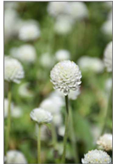
Ping Pong White Globe Amaranth flowers

Ping Pong White Globe Amaranth is recommended for the following landscape applications;