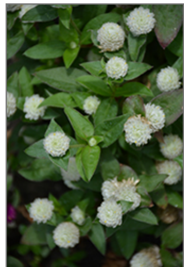
Ping Pong White Globe Amaranth flowers