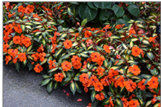
SunPatiens Vigorous Tropical Orange New Guinea Impatiens in bloom