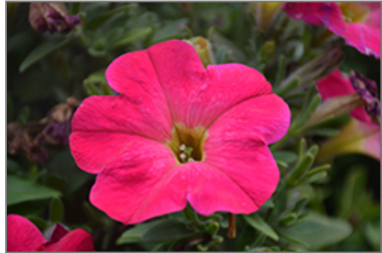
Hells Flamin' Rose Petunia flowers