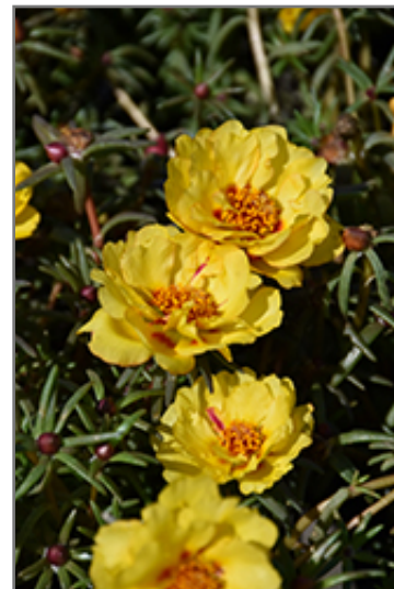
Happy Hour Banana Portulaca flowers

Happy Hour Banana Portulaca is recommended for the following landscape applications;