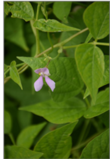
Golden Wax Bean flowers

Golden Wax Bean will grow to be about 10 feet tall at maturity, with a spread of 24 inches. When planted in rows, individual plants should be spaced approximately 12 inches apart. Because of its vigorous growth habit, it may require staking or supplemental support. This fast-growing vegetable plant is an annual, which means that it will grow for one season in your garden and then die after producing a crop. Because of its relatively short time to maturity, it lends itself to a series of successive plantings each staggered by a week or two; this will prolong the effective harvest period.