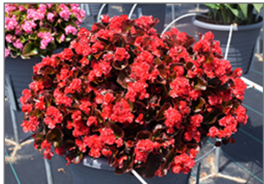
Double Up Red Begonia in bloom