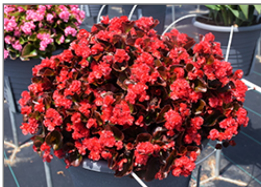
Double Up Red Begonia in bloom