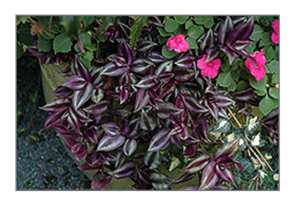
Burgundy Wandering Jew foliage