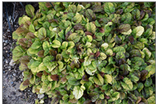
Feathered Friends Parrot Paradise Bugleweed