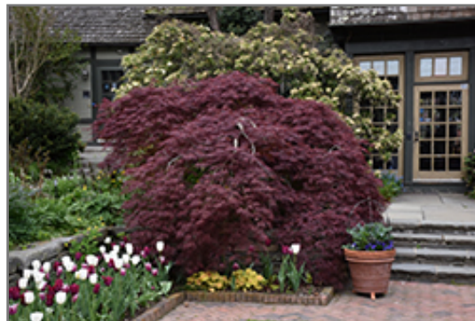
Tamukeyama Japanese Maple

Tamukeyama Japanese Maple is recommended for the following landscape applications;