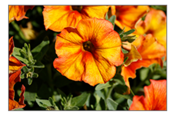
SuperCal Premium Sunset Orange Petchoa flowers

Wolf Hill Ipswich 60 Turnpike Rd (Route 1) Ipswich, MA 01938 978-356-6342