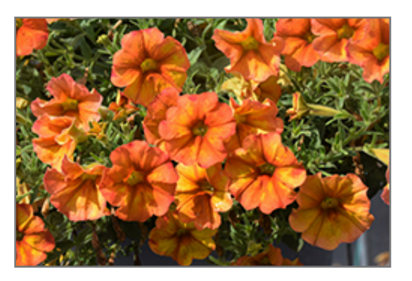
SuperCal Premium Sunset Orange Petchoa flowers

SuperCal Premium Sunset Orange Petchoa is recommended for the following landscape applications;