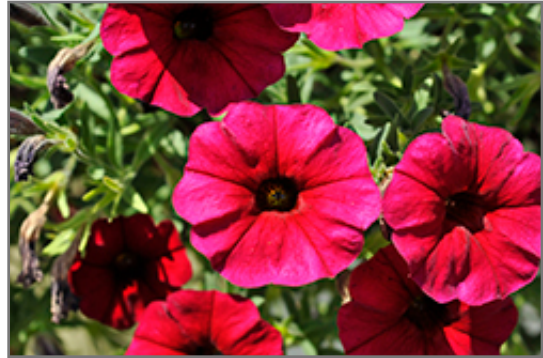
SuperCal Royal Red Petchoa flowers

SuperCal Royal Red Petchoa is a fine choice for the garden, but it is also a good selection for planting in outdoor containers and hanging baskets. Because of its trailing habit of growth, it is ideally suited for use as a 'spiller' in the 'spiller-thriller-filler' container combination; plant it near the edges where it can spill gracefully over the pot. Note that when growing plants in outdoor containers and baskets, they may require more frequent waterings than they would in the yard or garden.