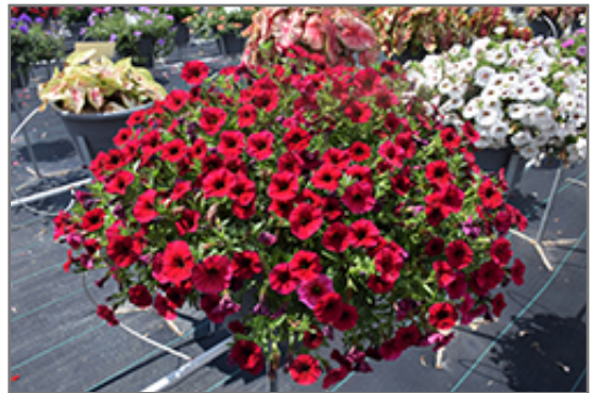
SuperCal Royal Red Petchoa in bloom