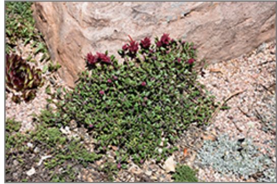
Marian Sampson Scarlet Monardella in bloom

Marian Sampson Scarlet Monardella will grow to be only 3 inches tall at maturity extending to 5 inches tall with the flowers, with a spread of 12 inches. When grown in masses or used as a bedding plant, individual plants should be spaced approximately 8 inches apart. Its foliage tends to remain low and dense right to the ground. It grows at a medium rate, and under ideal conditions can be expected to live for approximately 3 years. As an evergreen perennial, this plant will typically keep its form and foliage year-round.