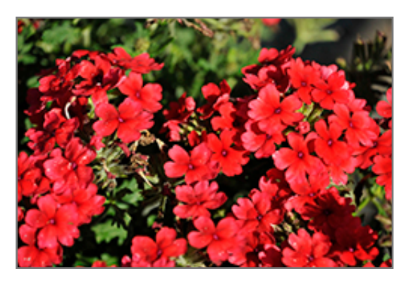
Estrella Dark Orange Verbena flowers