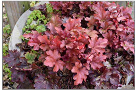
Peach Flambe Coral Bells

Peach Flambe Coral Bells is a fine choice for the garden, but it is also a good selection for planting in outdoor pots and containers. It is often used as a 'filler' in the 'spiller-thriller-filler' container combination, providing a mass of flowers and foliage against which the larger thriller plants stand out. Note that when growing plants in outdoor containers and baskets, they may require more frequent waterings than they would in the yard or garden.