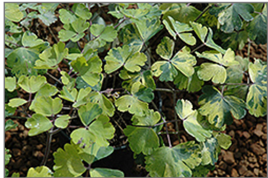
Leprechaun Gold Columbine foliage