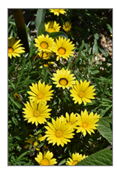
Colorado Gold Gazania flowers

Colorado Gold Gazania is recommended for the following landscape applications;