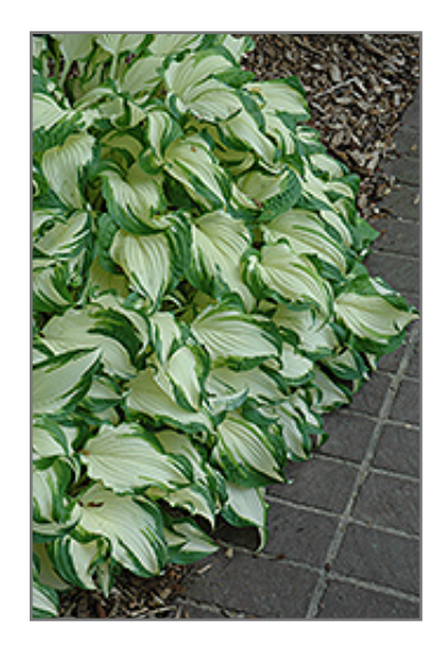
White Christmas Hosta foliage

Wolf Hill Ipswich 60 Turnpike Rd (Route 1) Ipswich, MA 01938 978-356-6342