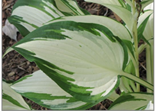
White Christmas Hosta foliage