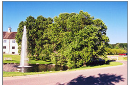
River Birch