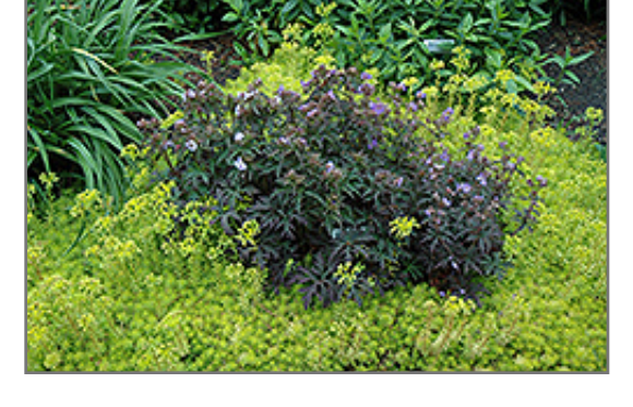
Dark Reiter Cranesbill in bloom