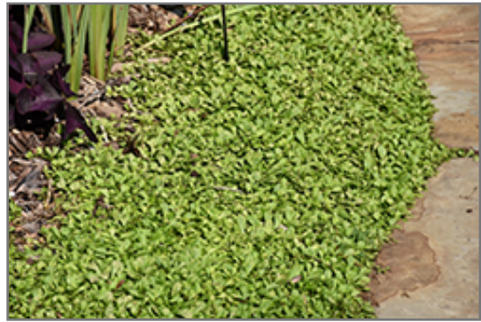
Creeping Mazus

Creeping Mazus will grow to be only 2 inches tall at maturity extending to 3 inches tall with the flowers, with a spread of 12 inches. Its foliage tends to remain low and dense right to the ground. It grows at a fast rate, and under ideal conditions can be expected to live for approximately 10 years. As an evergreen perennial, this plant will typically keep its form and foliage year-round.