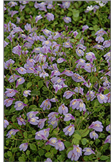
Creeping Mazus flowers

Creeping Mazus is recommended for the following landscape applications;