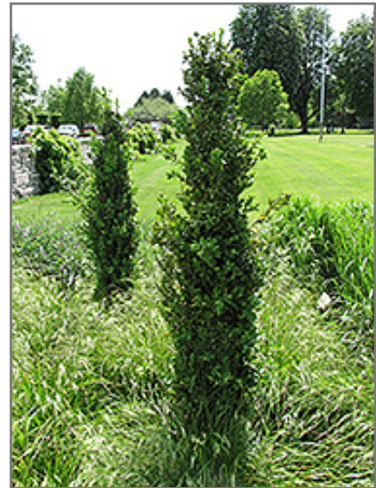
Graham Blandy Boxwood