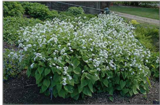
Perennial Money Plant in bloom

Perennial Money Plant is recommended for the following landscape applications;