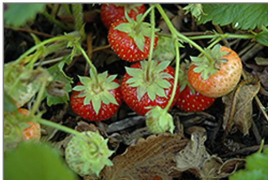
Common Wild Strawberry

Common Wild Strawberry features dainty white cup-shaped flowers with yellow eyes along the stems from late spring to early summer. Its attractive tomentose round compound leaves remain green in color throughout the season. It features an abundance of magnificent cherry red berries from late spring to late summer.