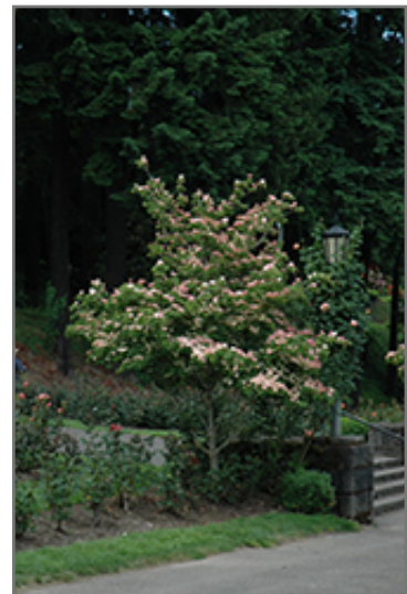
Heart Throb Chinese Dogwood in bloom