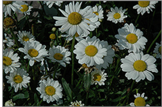
May Queen Shasta Daisy flowers