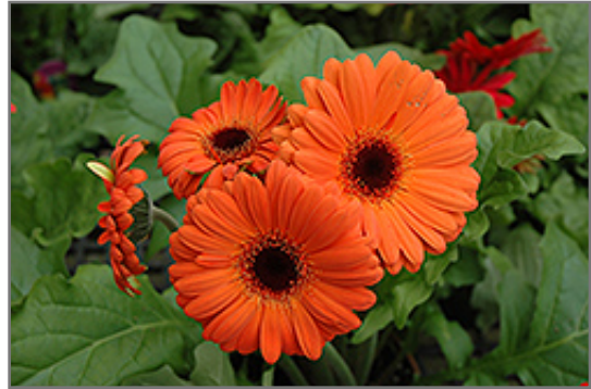
Orange Gerbera Daisy flowers