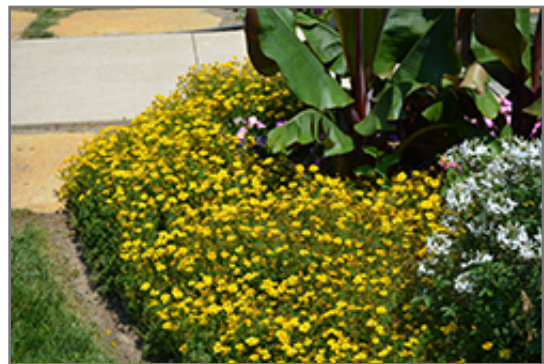
Goldilocks Rocks Bidens in bloom