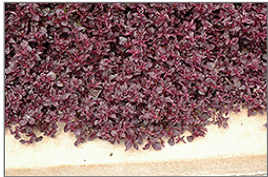
Purple Lady Blood Leaf