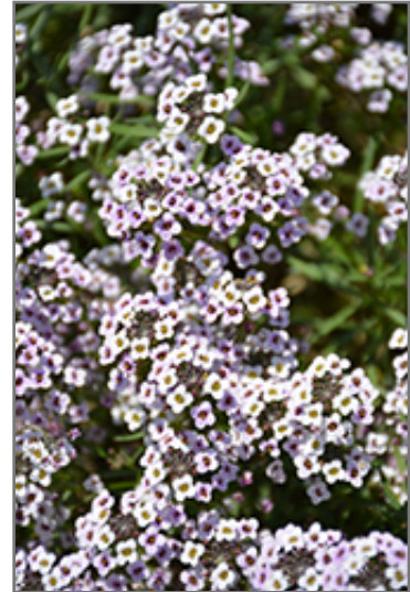
Blushing Princess Sweet Alyssum flowers

This plant will require occasional maintenance and upkeep, and should not require much pruning, except when necessary, such as to remove dieback. It is a good choice for attracting bees and butterflies to your yard, but is not particularly attractive to deer who tend to leave it alone in favor of tastier treats. It has no significant negative characteristics.