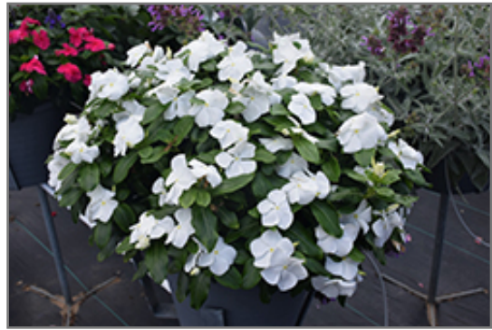
Titan Pure White Vinca in bloom

Titan Pure White Vinca is a fine choice for the garden, but it is also a good selection for planting in outdoor containers and hanging baskets. It is often used as a 'filler' in the 'spiller-thriller-filler' container combination, providing a mass of flowers against which the thriller plants stand out. Note that when growing plants in outdoor containers and baskets, they may require more frequent waterings than they would in the yard or garden.