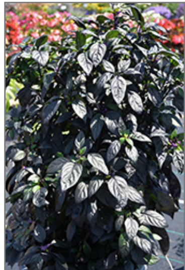
Black Pearl Ornamental Pepper