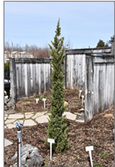
Trautman Juniper

This shrub should only be grown in full sunlight. It is very adaptable to both dry and moist growing conditions, but will not tolerate any standing water. It is not particular as to soil type or pH. It is highly tolerant of urban pollution and will even thrive in inner city environments. This is a selected variety of a species not originally from North America.