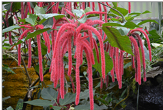
Firetail Chenille Plant flowers