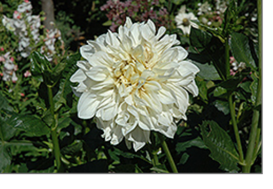
Fleurel Dahlia flowers