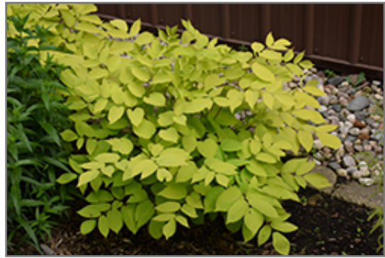
Sun King Japanese Spikenard