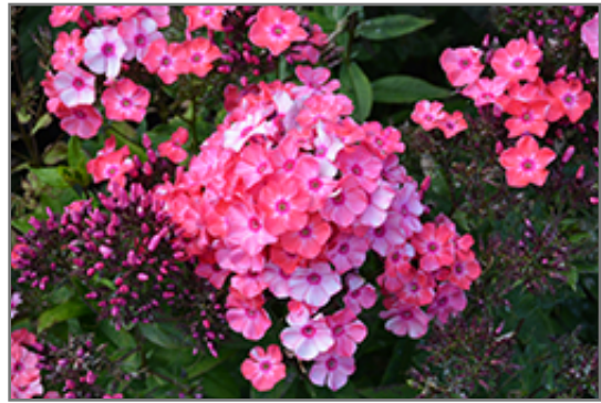
Garden Girls Glamour Girl Garden Phlox flowers

Garden Girls Glamour Girl Garden Phlox is recommended for the following landscape applications;