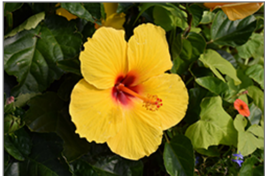
Sunny Wind Hibiscus flowers

This plant is native to the tropics and prefers growing in moist environments with evenly warm conditions all year round. In our climate, it is usually grown as an outdoor annual in the garden or in a container. If you want it to survive the winter, it can be brought in to the house and provided with special care, and then returned to the garden the following season. In its preferred tropical habitat, it can grow to be around 6 feet tall at maturity, with a spread of 6 feet. However, when grown as an annual or when overwintered indoors, it can be expected to perform differently, and its exact height and spread will depend on many factors; you may wish to consult with our experts as to how it might perform in your specific application and growing conditions.