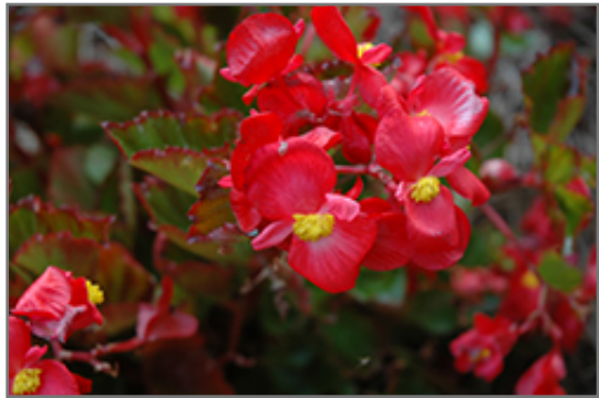
BabyWing Red Begonia flowers

BabyWing Red Begonia is a fine choice for the garden, but it is also a good selection for planting in outdoor containers and hanging baskets. It is often used as a 'filler' in the 'spiller-thriller-filler' container combination, providing a mass of flowers and foliage against which the thriller plants stand out. Note that when growing plants in outdoor containers and baskets, they may require more frequent waterings than they would in the yard or garden.