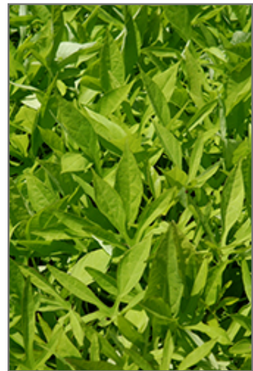
SolarPower Lime Sweet Potato Vine foliage