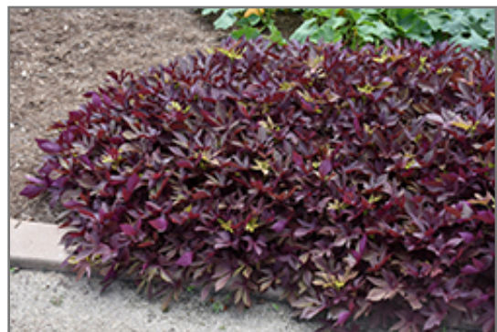
SolarPower Red Sweet Potato Vine