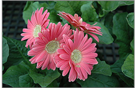
Pink Gerbera Daisy flowers

When grown indoors, Pink Gerbera Daisy can be expected to grow to be about 12 inches tall at maturity extending to 16 inches tall with the flowers, with a spread of 12 inches. It grows at a fast rate, and under ideal conditions can be expected to live for approximately 3 years. This houseplant will do well in a location that gets either direct or indirect sunlight, although it will usually require a more brightly-lit environment than what artificial indoor lighting alone can provide. It does best in average to evenly moist soil, but will not tolerate standing water. The surface of the soil shouldn't be allowed to dry out completely, and so you should expect to water this plant once and possibly even twice each week. Be aware that your particular watering schedule may vary depending on its location in the room, the pot size, plant size and other conditions; if in doubt, ask one of our experts in the store for advice. It is not particular as to soil type or pH; an average potting soil should work just fine.