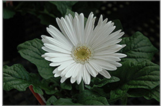
White Gerbera Daisy flowers

When grown indoors, White Gerbera Daisy can be expected to grow to be about 12 inches tall at maturity extending to 16 inches tall with the flowers, with a spread of 12 inches. It grows at a fast rate, and under ideal conditions can be expected to live for approximately 3 years. This houseplant will do well in a location that gets either direct or indirect sunlight, although it will usually require a more brightly-lit environment than what artificial indoor lighting alone can provide. It does best in average to evenly moist soil, but will not tolerate standing water. The surface of the soil shouldn't be allowed to dry out completely, and so you should expect to water this plant once and possibly even twice each week. Be aware that your particular watering schedule may vary depending on its location in the room, the pot size, plant size and other conditions; if in doubt, ask one of our experts in the store for advice. It is not particular as to soil type or pH; an average potting soil should work just fine.