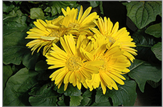
Yellow Gerbera Daisy flowers

When grown indoors, Yellow Gerbera Daisy can be expected to grow to be about 12 inches tall at maturity extending to 16 inches tall with the flowers, with a spread of 12 inches. It grows at a fast rate, and under ideal conditions can be expected to live for approximately 3 years. This houseplant will do well in a location that gets either direct or indirect sunlight, although it will usually require a more brightly-lit environment than what artificial indoor lighting alone can provide. It does best in average to evenly moist soil, but will not tolerate standing water. The surface of the soil shouldn't be allowed to dry out completely, and so you should expect to water this plant once and possibly even twice each week. Be aware that your particular watering schedule may vary depending on its location in the room, the pot size, plant size and other conditions; if in doubt, ask one of our experts in the store for advice. It is not particular as to soil type or pH; an average potting soil should work just fine.