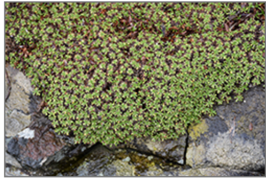
Cushion Bolax

Cushion Bolax is recommended for the following landscape applications;