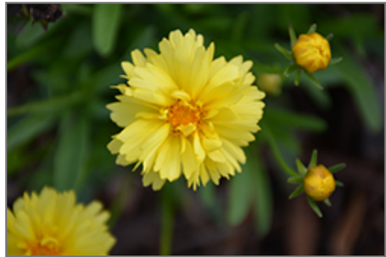
Leading Lady Charlize Tickseed flowers

Leading Lady Charlize Tickseed is recommended for the following landscape applications;