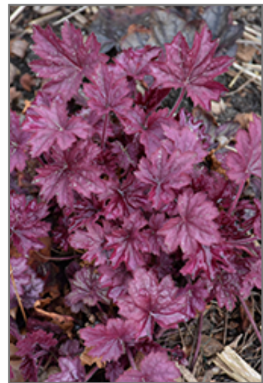
Wild Rose Coral Bells foliage