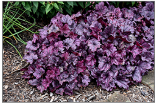
Wild Rose Coral Bells

This is a relatively low maintenance plant, and should be cut back in late fall in preparation for winter. It is a good choice for attracting hummingbirds to your yard. It has no significant negative characteristics.