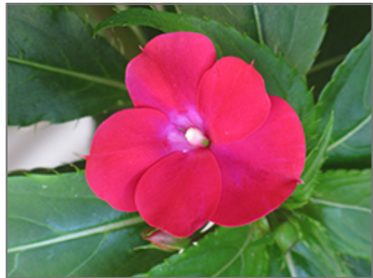
Infinity Cherry Red New Guinea Impatiens flowers